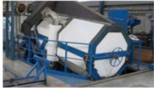
PIEC DO KTÓREGO TRAFIA FORMA WYPEŁNIONA GRANULATEM