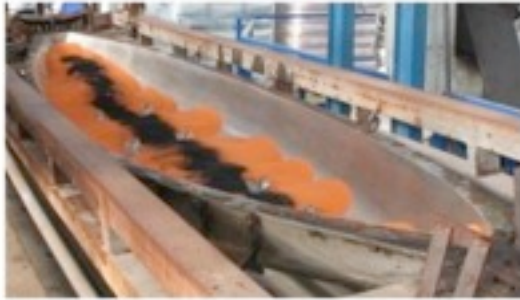
DOLNA CZĘŚĆ FORMY Z GRANULATEM POLIETYLENOWYM

Polyethylene kayaks are dedicated most of all for difficult waters with numerous rocks and obstacles. Due to its great resistance from damage and easy repairs, they are being chosen first of all by rentals and organizers of canoe rallies, customers, who value resistance of the kayak the most and are prepared for the extra weight.