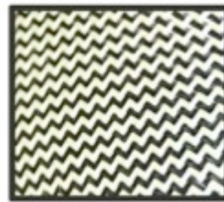
CARBON - KEVLAR